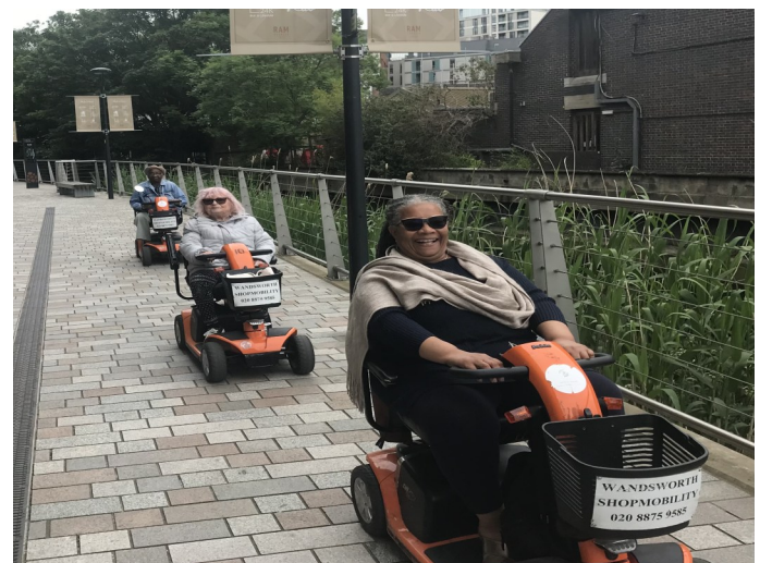
Why not try a Mobility Scooter at the Shopmobility Open Day?