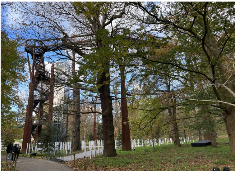
If you are feeling really adventurous, try the tree-top walk. Fully-accessible by lift and one of the stops on the land train.

We are extremely fortunate to get our tickets at a fantastically reduced rate, when the normal cost is £22. It is well worth a visit (at £10 a person, including entry fee) and it will be lovely in the summer with fantastic flowers and more.