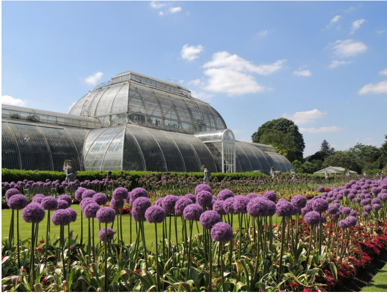
The Palm House at Kew