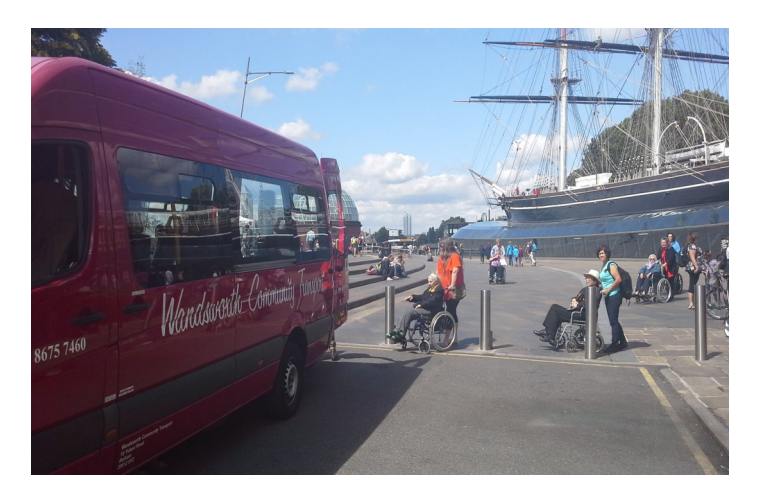
Picking up at the Cutty Sark and Beach Huts at Herne Bay

We return by minibus as the picture shows. Let's hope it's another lovely day!