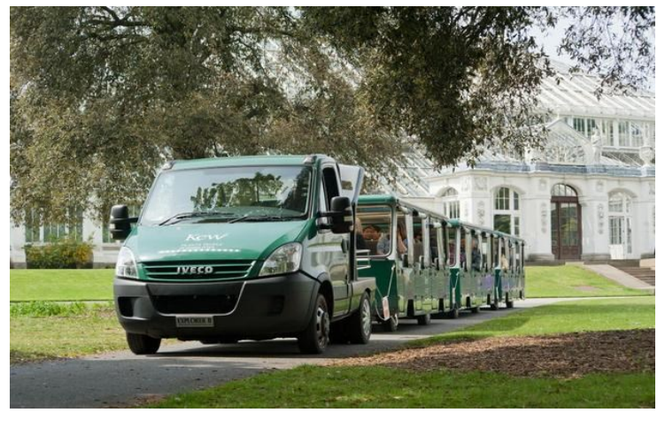
Let the train take the strain! The land train at Kew Gardens

But places are limited, so book early. We expect them to go like hot scones with clotted cream. Don't forget we also hope you will go along with the theme and wear your favourite hat, but stress this is optional.