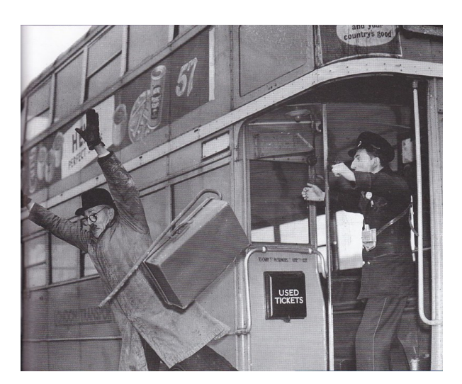
Hold on Tight Please—a public information message from the 50s

It definitely came out that you loved our original script, and we aren't changing that, but the roundel looks great and will be easier to fit onto leaflets and newsletters. Thanks to all those who contributed, and it shows it is worth giving us your email addresses to keep in the loop.