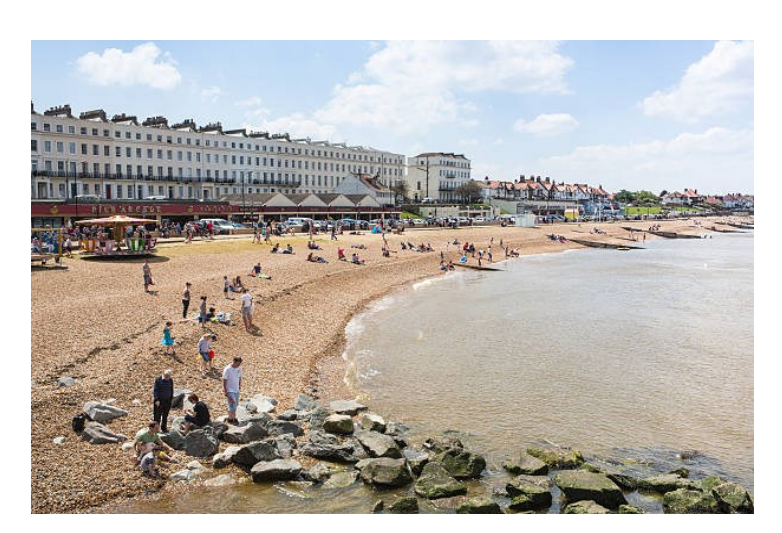
New this summer—traditional British seaside resort, Herne Bay

You will find enclosed a membership renewal and survey form. We need to keep our records up to date and we are also very keen to discover your opinion of the service. Please would you take some time to complete the form. It will ensure you keep your place on our mailing list and receive future newsletters.