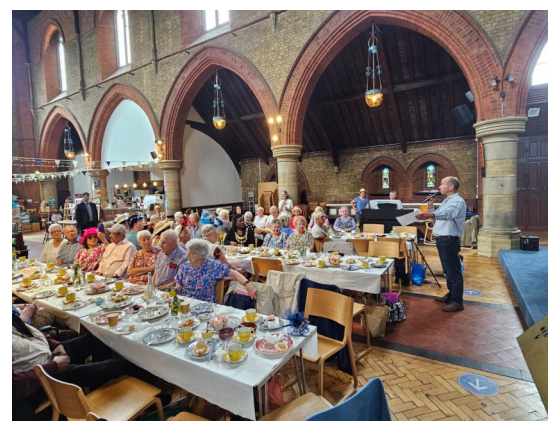
Last Year's Mad Hatters Tea Party