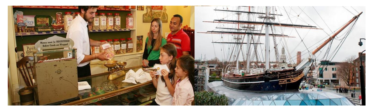
The Sweet Shop at Milestones Museum and the Cutty Sark at Greenwich