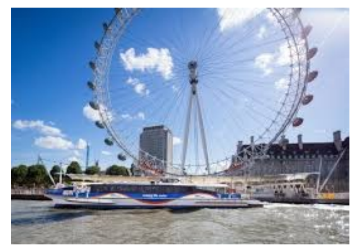
Thames Clipper passing the London Eye

bad However. the news is that we have understandably lost some funding (25% now since 2015) so we need your help to make ends meet. We are determined to freeze shopping fares at £2.50 and to keep the cost of outings at last year's prices.