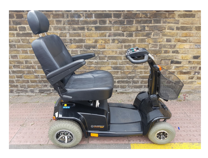
8 MPH Scooter for sale -£450 with new batteries

Another new one this summer is the boat trip from Westminster to Greenwich, passing through some of the most iconic scenery on the Thames. The Houses of Parliament, The London Eye, The Tower of London, Tower Bridge and Canary Wharf are all on the route, and we finish at historic Greenwich, from where we return by minibus after lunch and a wander. The boats are accessible (except for the toilets) but be warned, there is some walking and a sloping gang way down to the river. The boat costs about £8, but TAKE YOUR FREEDOM PASS FOR A DISCOUNT. The minibus fare is £6.